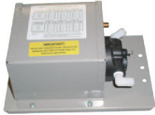
High Output Diaphragm Pump